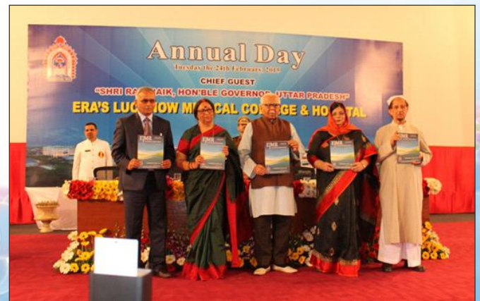
Era's Journal of Medical Research being released by Shri Ram Naik, The Honourable Governor of UP