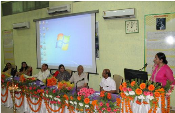
WORKSHOP ON ETHICS IN MEDICAL RESEARCH HELD ON 16 th APRIL 2015