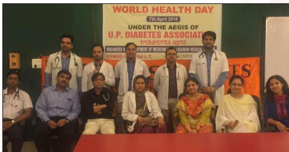
Diabetes quiz on world health day 7th April, 2016 organised by department of Medicine